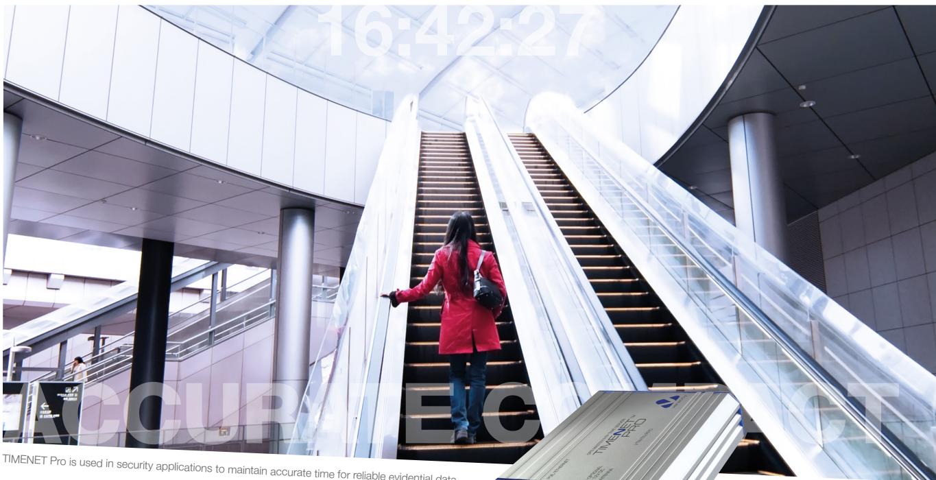
TIMENET Pro is used in security applications to maintain accurate time for reliable evidential data.

Accurate, low cost, extremely compact universal atomic clock reference for network time synchronisation