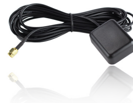
TIMENET Pro comes with antenna and 5 metre cable included.