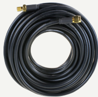
TIMENET Pro Antenna Extension Cable 10 metres